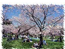
Cherry blossoms May–Early June