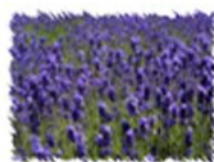
Lavender Mid June–Early Oct