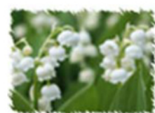
Lily of the valley Late April–Mid May

Under the blue sky, the ground spreads free and easy. Hokkaido is blessed with a cool climate that makes Hokkaido a "Hanatairiku (flower continent)" full of flowers. Many tourists come to Hokkaido from Japan and from all around the world to see those flowers, and go back to their homes with many wonderful impressions as souvenirs.