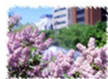
Lilac Mid May–Mid June