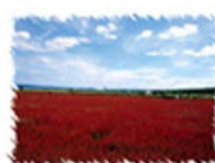
Sangosou Late Aug–Late Sept