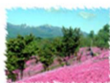
Moss phlox May–June