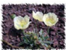
Natural Flower Garden