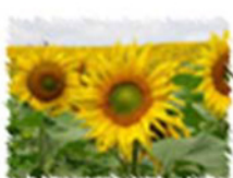
Sunflower Mid July–Mid Oct