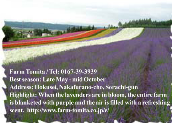
Farm Tomita / Tel: 0167-39-3939 Best season: Late May - mid October Address: Hokusei, Nakafurano-cho, Sorachi-gun Highlight: When the lavenders are in bloom, the entire farm is blanketed with purple and the air is filled with a refreshing scent. http://www.farm-tomita.co.jp/e/