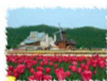
Tulip May–Mid August