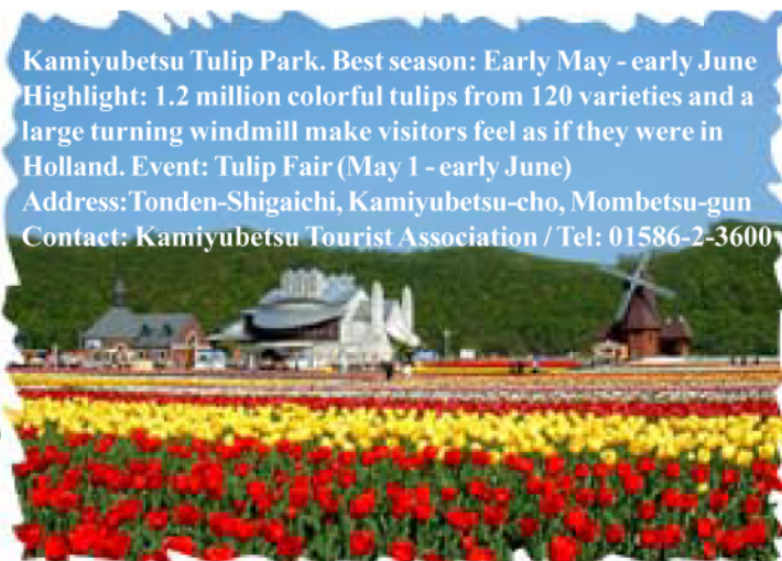
Kamiyubetsu Tulip Park. Best season: Early May - early June Highlight: 1.2 million colorful tulips from 120 varieties and a large turning windmill make visitors feel as if they were in Holland. Event: Tulip Fair (May 1 - early June) Address: Tonden-Shigaichi, Kamiyubetsu-cho, Mombetsu-gun Contact: Kamiyubetsu Tourist Association / Tel: 01586-2-3600