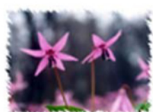
dogtooth violet May